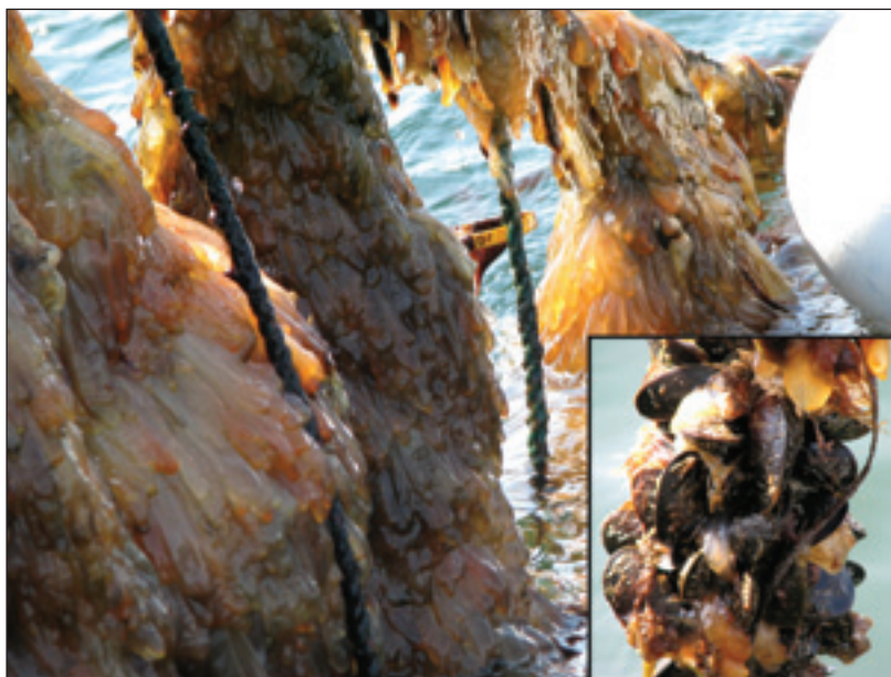
Figure 1. Socks of blue mussels coated in Ciona intestinalis . Inset: close-up of blue mussels with C. intestinalis adhering to them.

astonishing population growth rates and spread. We disagree, and suggest that it may be feasible to eradicate Ciona and other established invaders, and that this should be assessed explicitly.