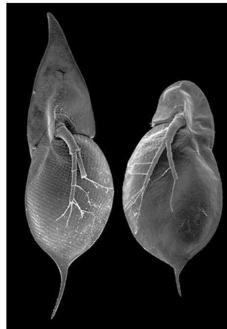
Figure 2 Scanning electron micrograph showing typical and predator-induced morphs of Daphnia cucullata of the same clone.

Induced chemical defences have been best studied in plants, but induced morphological defences have been best studied in animals. Helmet formation in Daphnia cucullata (Fig. 2) is a textbook example of cyclomorphosis 21 (seasonal variation in morphology),